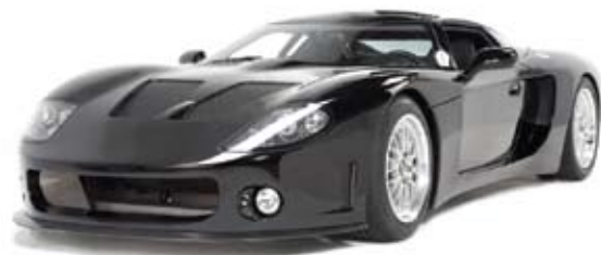
CMT-380 Concept Car

The CMT-380 is the world's first microturbine-powered supercar. This sleek hybrid-electric sports car draws its power from lithium polymer batteries and a Capstone C30 microturbine. The CMT-380 proves that a plug-in hybrid can deliver the driving experience of a high-performance supercar and achieve extremely high fuel economy, reduced greenhouse gas emissions and ultra-clean vehicle emissions.